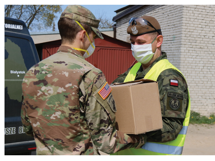
Soldiers from Bravo Company, 418th Civil Affairs Battalion, 308th Civil Affairs Brigade, 1st Infantry Division Forward, 353rd Civil Affairs Command, work with Polish forces from 1st Brigade, Territorial Defense Force, to distribute food to local authorities and medical facilities, 28 April 2020, in Monki, Poland.

More than strategic economy-of-force, comprehensive, continuous and consistent engagement is a scaled-up version of General Stanley McChrystal's "collaborative warfare." Joint Publication 3-08, Interorganizational Cooperation , describes collaboration as "a process where organizations work together to attain common goals by sharing knowledge, learning, and building consensus." As an employment of a strategic narrative of inclusion, a collaborative warfare approach to engagement enables the United States