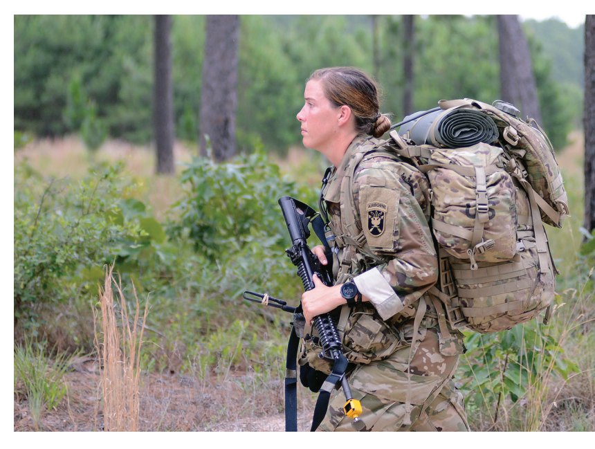
A Soldier assigned to the U.S. Army John F. Kennedy Special Warfare Center and School participating in the Civil Affairs (CA) Course walks through a wooded area while taking part in Sluss-Tiller, the culmination exercise for CA students, at Fort Bragg, North Carolina, 9 June 2020. The Soldiers were trained in culture, language, social sciences, civil analysis and planning in complex ambiguous environments in order to carry out CA operations in the special operations community.

Many of these programs leverage reserve forces capacities. The National Guard's State Partnership Program, a highly-effective, low-cost training and institution-building program, builds relationships that can generate strategic and operational capital. Similarly, the U.S. Military Observer Group, a joint program run by the Army, provides United Nations field missions with staff augmentation and military observers who act as "strategic scouts" and "strategic enablers."<sup>27</sup> In addition to benefits to readiness and emergency